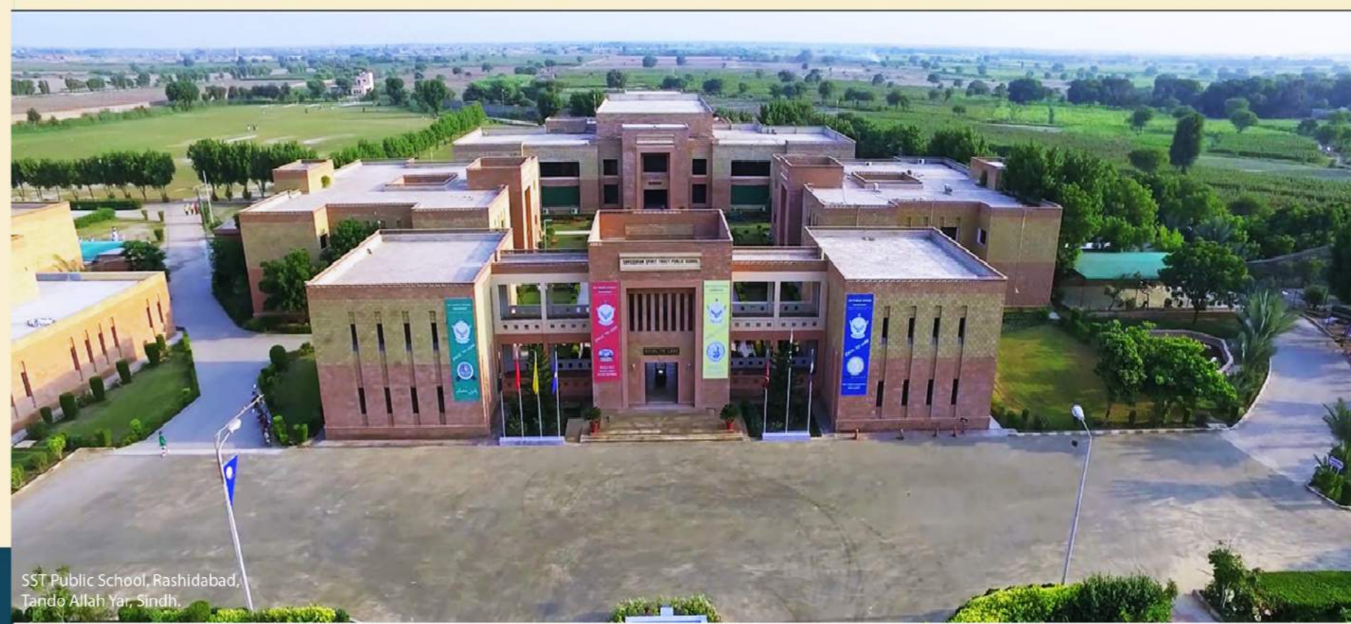
SST Public School, Rashidabad, Tando Allah Yar, Sindh.